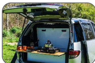
Undercover cooking area