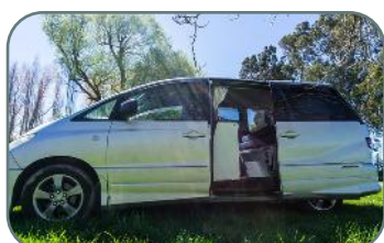
Sink, fresh and grey water system