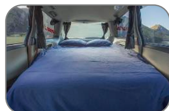
Large comfy double bed