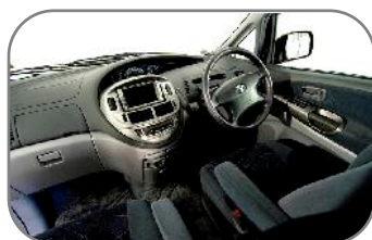
Drives like a good car