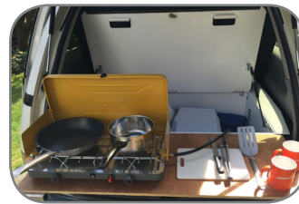
Dual burner gas cooker