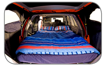
Large comfy double bed