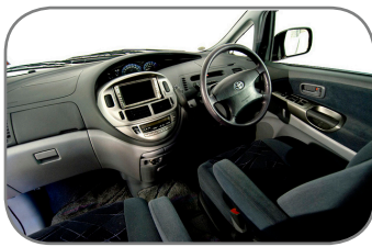
Newer, lower mileage vehicle